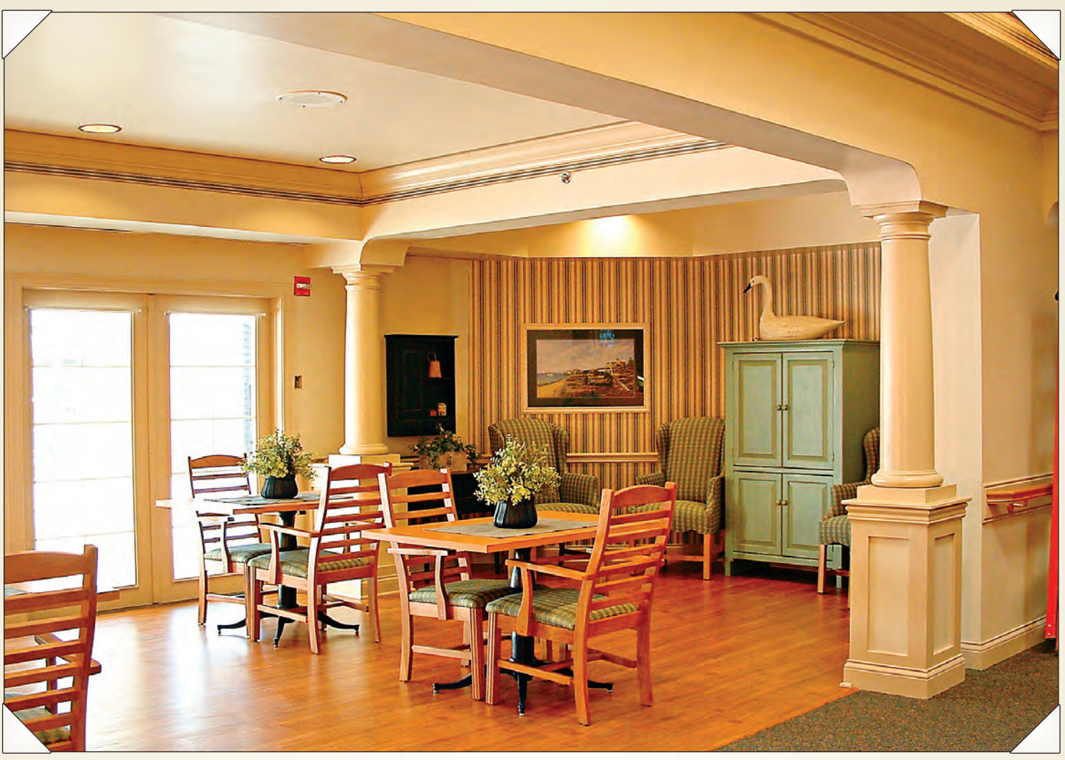
The facility layout was carefully considered to allow nurses easy access to areas where problems are most likely to occur. Nurses at the high-tech welcome center (below) can keep an eye on residents in the living room (above).

unsupervised residents safe. Each wing at Coventry House Inn wraps around an exterior courtyard. Access codes are needed to enter this area, but even if residents defeat this safeguard somehow, they should still be prevented from wandering away from the facility. Exterior porches feature high rails that are attractive, but also provide a difficult obstacle to climb over.