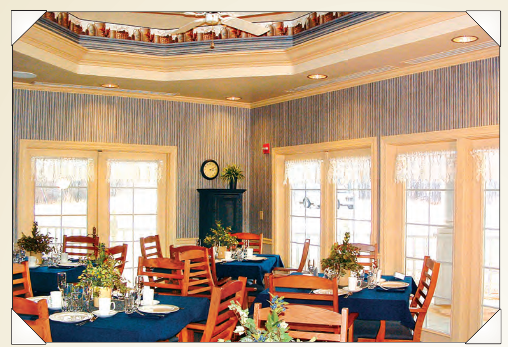
This dining room features a vaulted ceiling and French doors that open out onto an enclosed porch. Residents can also reserve a private dining room for small gatherings.