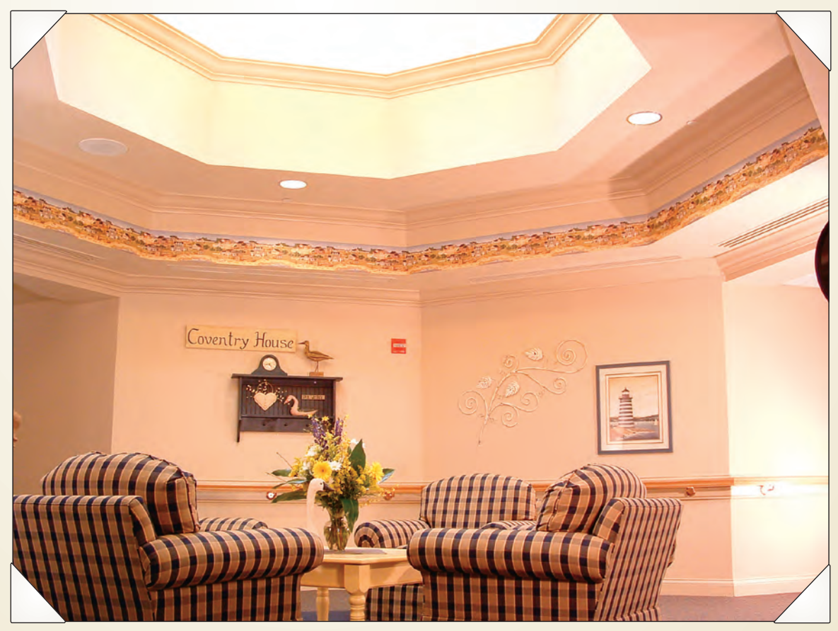
Coventry House Inn defies the trend of designing box-like rooms and corridors to facilitate complex mechanical and electrical installations in nursing homes.

Construction codes can add significant costs to nursing home construction, but owners can also save money by adhering to the minimum requirements that are required. For example, the Michigan State Manual of Nursing Homes requires only one toilet for every eight residents and only one bathing unit for every twenty residents. Bathing units can put a sizeable strain on a nursing home construction budget because they must accommodate patients in wheelchairs, as well as those who need assistance with bathing. The Coventry House Inn project team carefully searched for ways to affordably exceed the construction codes in order to preserve the privacy and dignity of the residents. The solution was to put a bath-