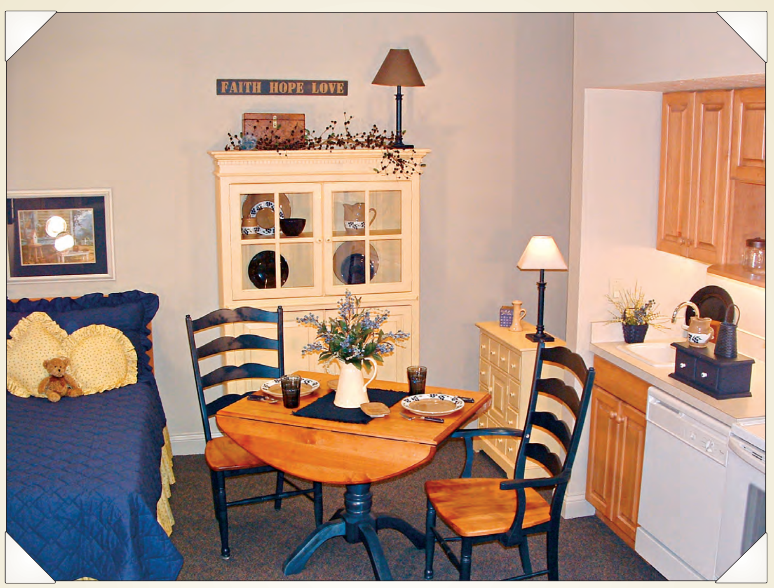
This unique occupational therapy room resembles a furnished apartment. Patients can practice the everyday tasks that are simple for most adults, but can be daunting challenges for patients recovering from injuries or strokes.

patients. The new wing of the facility houses a well-equipped physical therapy room and a unique occupational therapy room that resembles a furnished apartment. Patients can practice