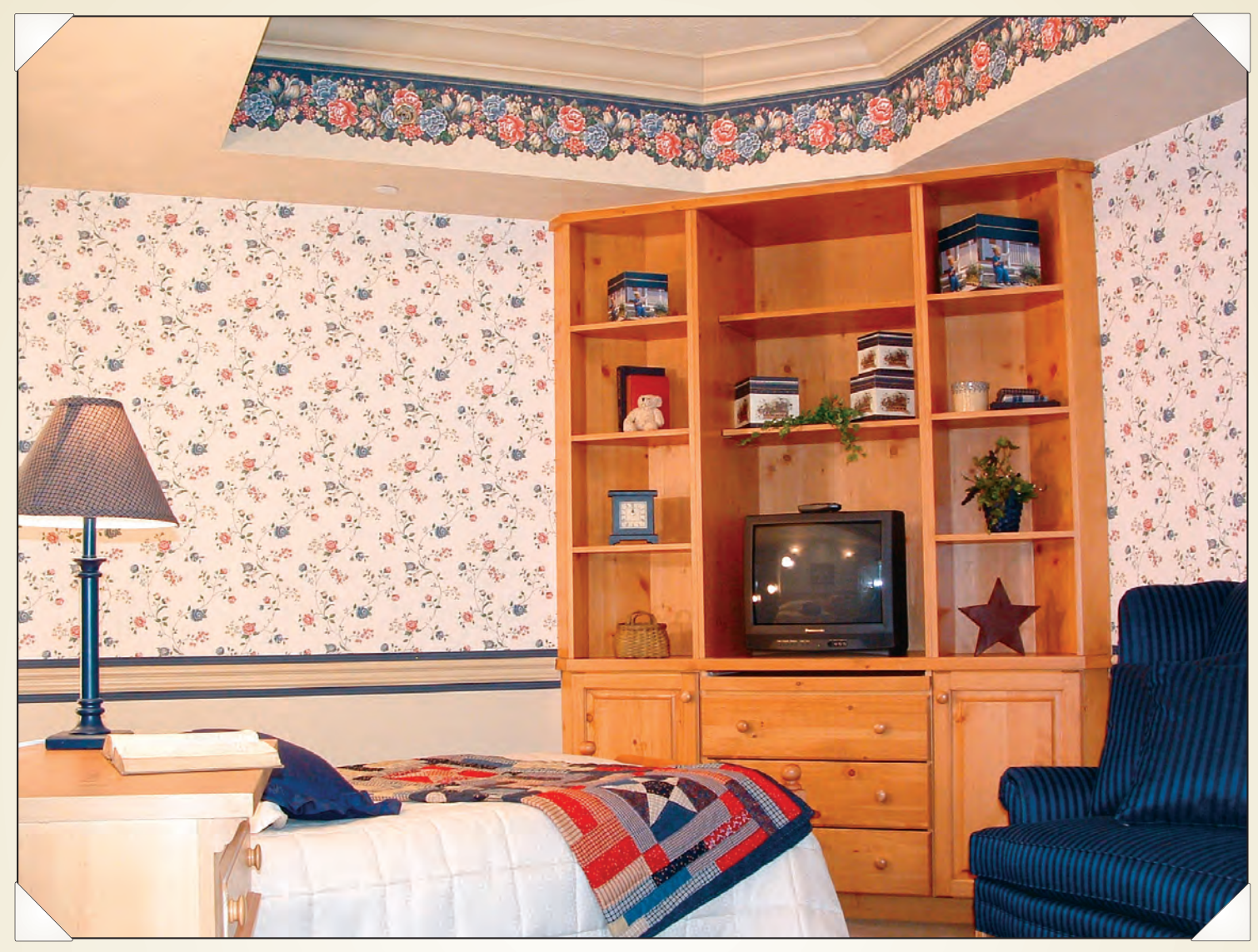
Custom-made cabinetry gives each room a homey feel. Cabinets include a sliding shelf that can be used for meals, allowing institutional overbed tables to be eliminated.

s strong as these mental pictures are, they are easily overpowered in an institutional setting. Few things are farther from home than an egg-crate mattress in a hospital room, apple pie served on a metal tray or the harsh reflection of sunlight as it glares off of the Plexiglas window at a nurse's station.